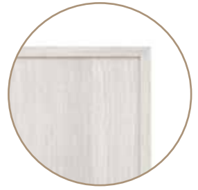
SLENDER RAIL 3/4" 1026