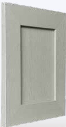
Featherstone PS05 Porcelain