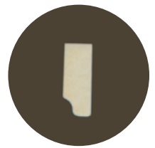
Light Valance 1034 (MDF)