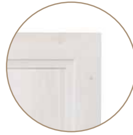
TRANSITIONAL RAIL 2-1/2" 1028