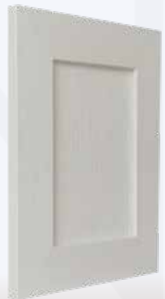
Vieni PS07 Dark Cream