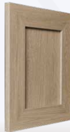
Kacaba PS02 Natural Oak