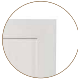
SHAKER RAIL 2-1/4" 1033