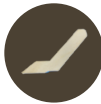
Crown 1002 (MDF)