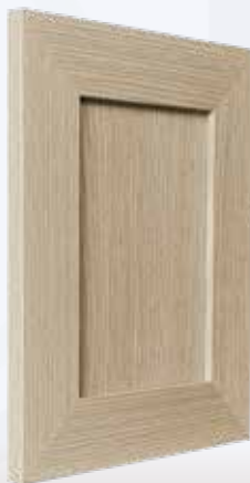
Peller PS04 Rift Oak