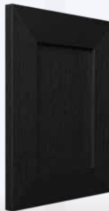
Tawes PS08 Dark Charcoal