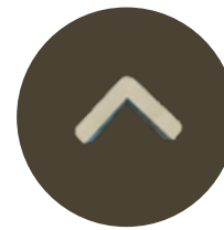
Outside Corner 1010 (POPLAR)