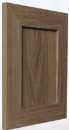
Calamus PS01 Nutwood

Available in 6 natural-looking wood patterns.